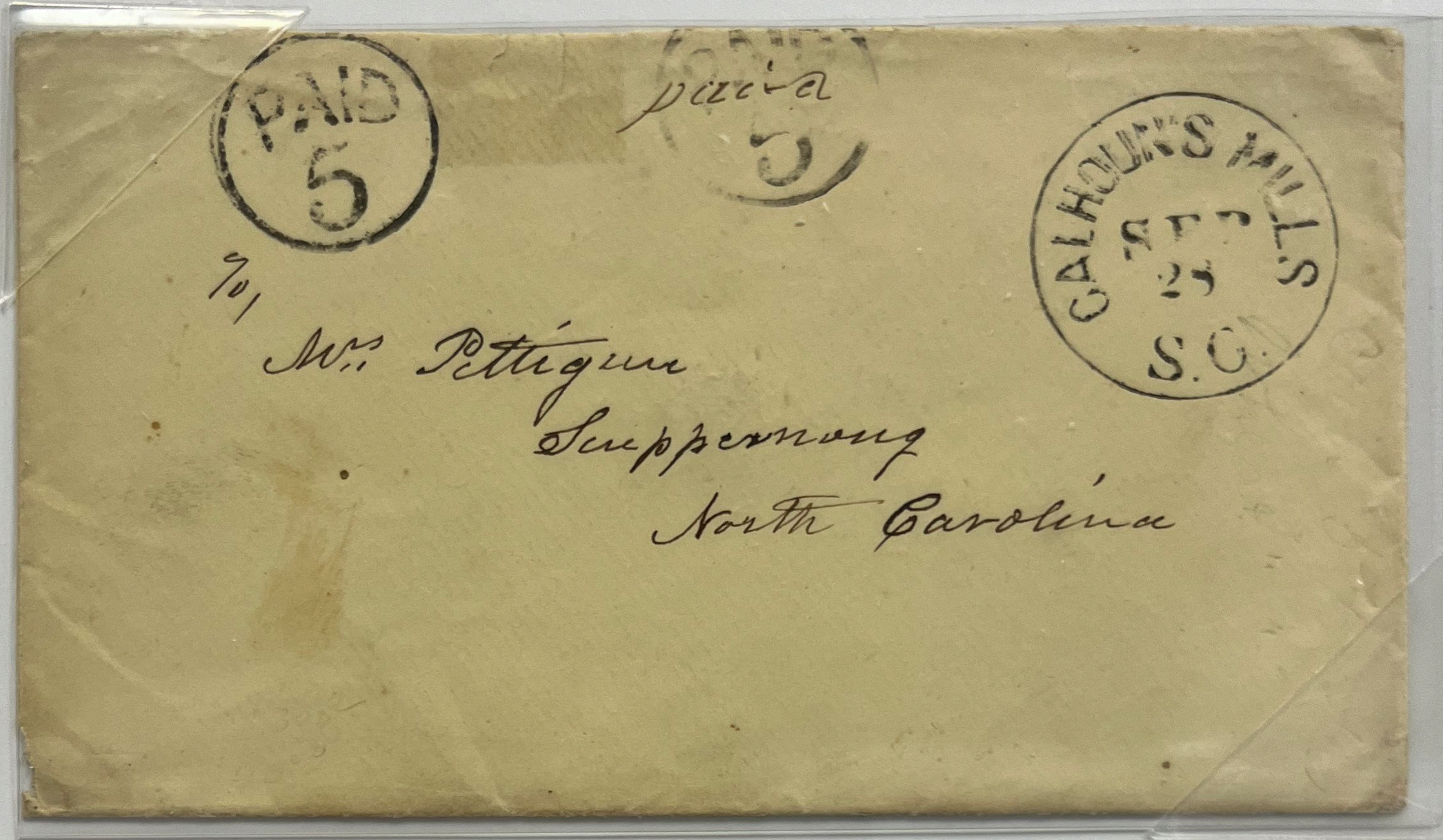
CALHOUN'S MILLS SC- 31mm Black CALHOUN'S MILLS CDS, dated Sep. 28, (1861). Handstamp Circle PAID 5 struck twice (double weight rate), Dietz Type I, New CSA Catalog Type A. Manuscript "paid" under one handstamp. Addressed to Mrs. Pettigree, SCUPPERNON, North Carolina. Ex-Cantey