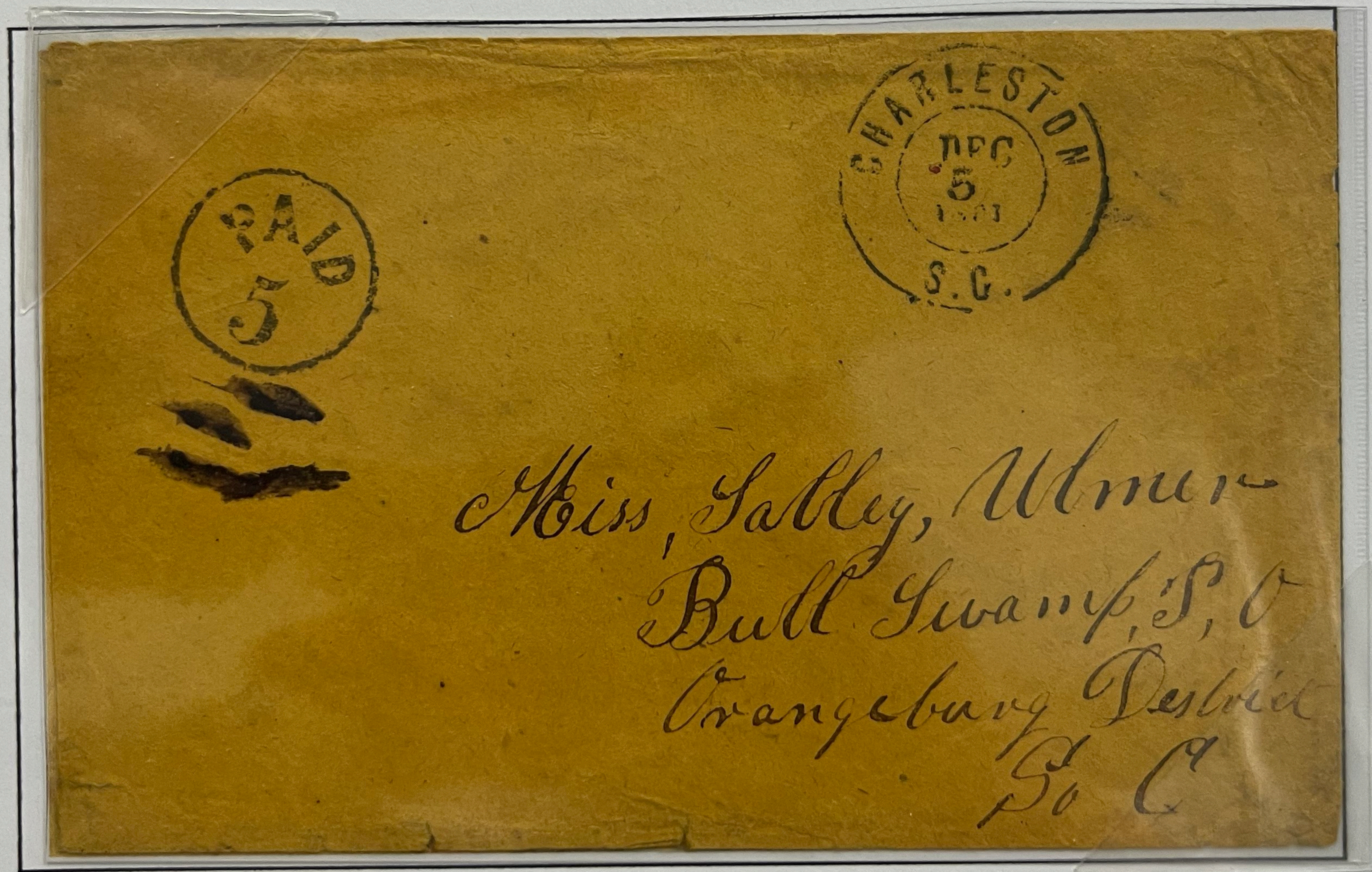
Stampless cover with a 26mm black DC YD CHARLESTON SC CDS, dated Dec. 5, 1861. Handstamp Circle PAID 5, Dietz Type III. Addressed to Miss Salley Ulmer, BULL SWAMP P. O., Orangeburg District, S.C.

Charleston, Charleston District, SC to Bull Swamp, Orangeburg District, SC