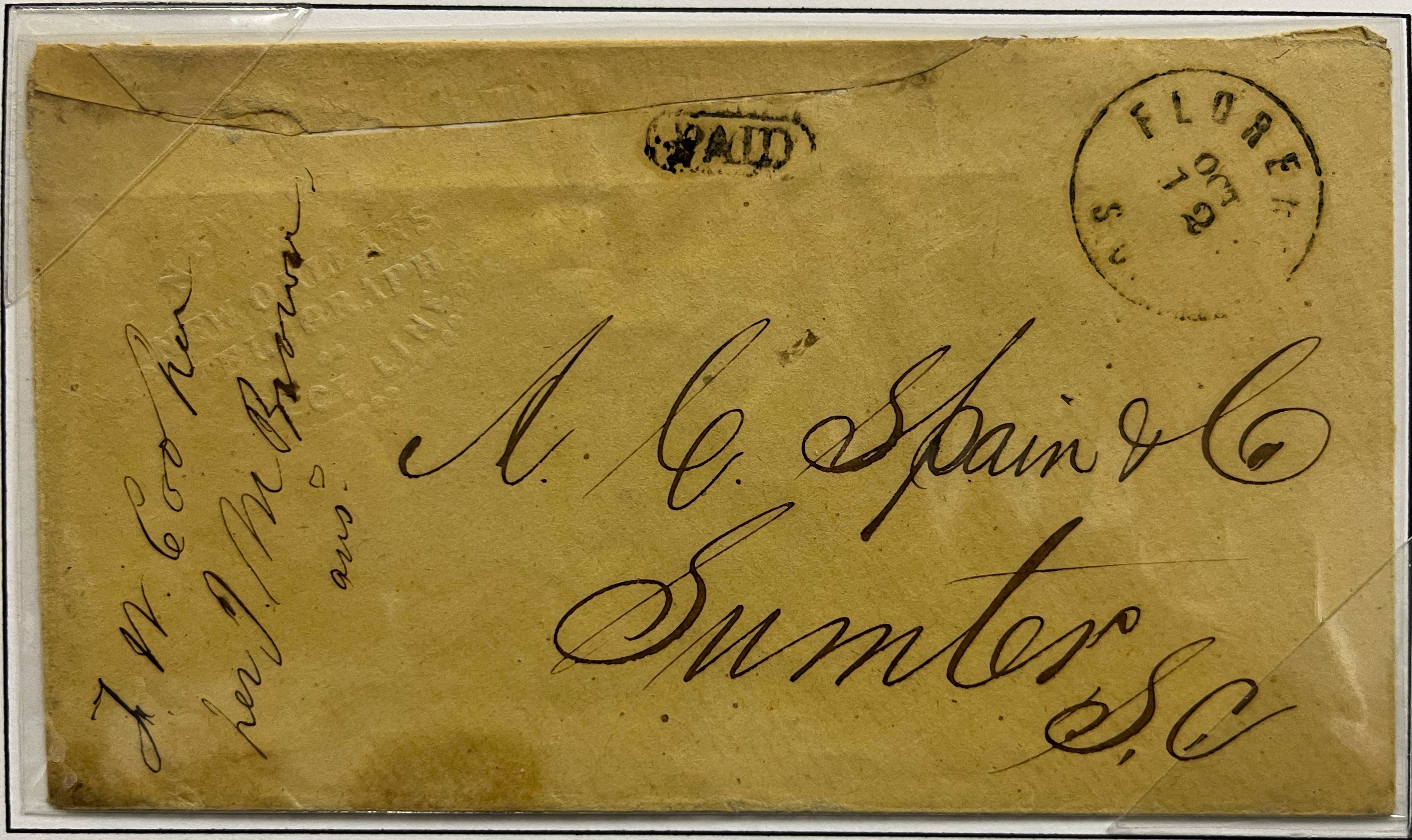
Stampless cover with a black 25mm FLORENCE SC CDS dated OCT 12. Addressed to A. C. Spain & Co, SUMTER, S. C.