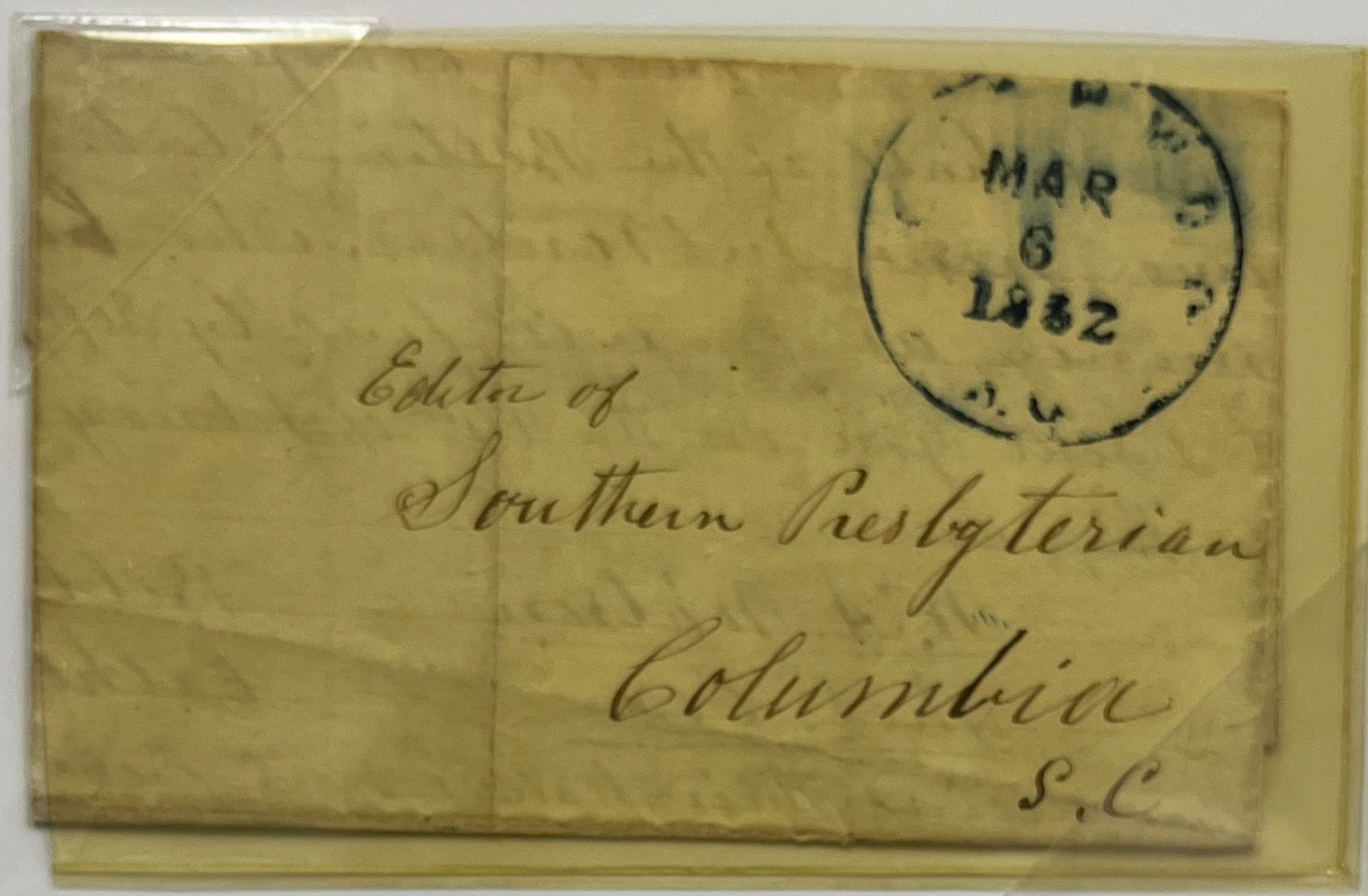
31mm Blue GREENWOOD SC, YD CDS, dated Mar. 6, 1862. No rate indicated, but folded letter to COLUMBIA, SC is a 5 cent rate. Addressed to Editor of Southern Presbyterian, COLUMBIA, S.C. ex-Cantey