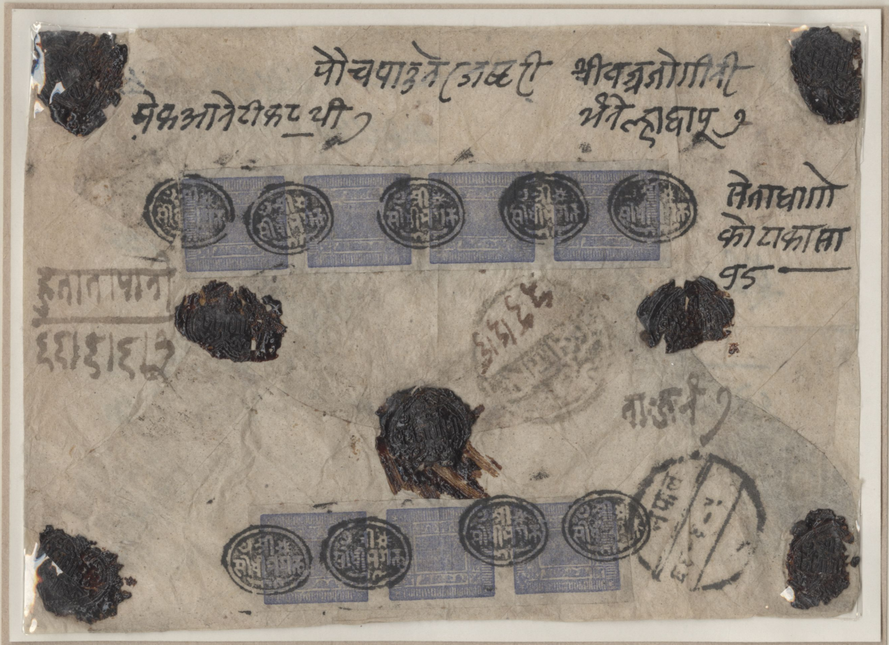
COVER WITH STRIP OF 4 AND STRIP OF 3 OF GRAY-BLUE STAMPS, ISSUE OF 1901-1907, 1 ANNA DENOMINATION.

CARRIED BY RUNNER FROM KUTI, TIBET TO TATAPANI, NEPAL WHERE IT WAS PROCESSED INTO THE NEPALESE POSTAL SYSTEM. SENT FROM NEPALESE JURISDICTIONAL COURT TO PRIME MINISTER, CHANDRA SHUMSHER JUNG.