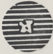
DHANKUTA UNDATED BLACK