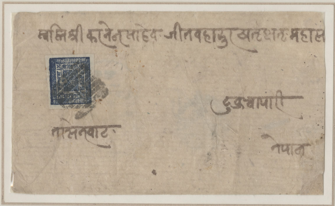
COVER WITH 1 ANNA BRIGHT BLUE STAMP, ISSUE OF 1901-1907.

PRINTED ON EUROPEAN WOVE PAPER, IMPERFORATE. RECUT FRAME VARIETY. OVERINKED CLICHE. SETT- ING 26 (STATE 2A).