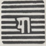
PALPA UNDATED BLACK