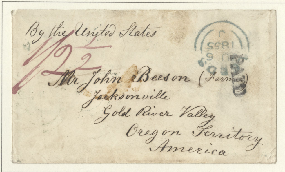
Unusual overseas use to Jacksonville O.T.