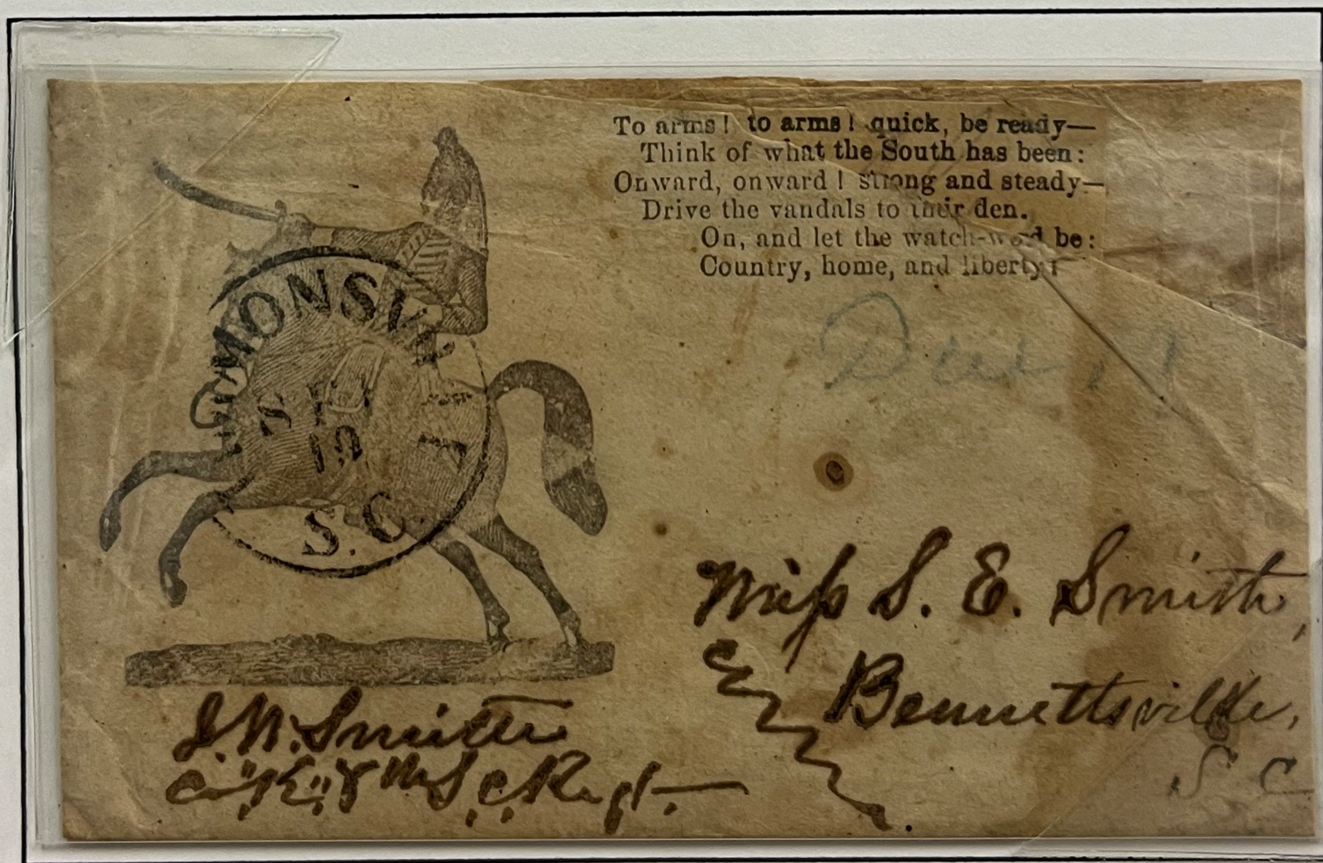
Patriotic Dragon Type SM-1 tied by a black 32mm TIMMONSVILLE SC CDS, dated SEP 10 on soldier's due cover. Manuscript blue pencil "Due 10". From j. m. Smith, Co k, 8 th SC Reg. Addressed to Miss S. E. Smith, BENNETTSVILLE, SC. Cover repaired through verse. No. 471