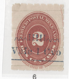
1887 Green Lines Ledger Paper