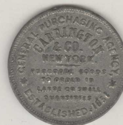
Carrington & Co. token for their NY to Cuba “Havana Express”