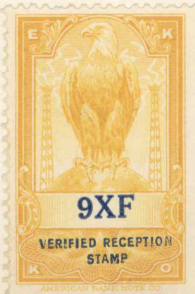
DOWNERS GROVE (CHICAGO)