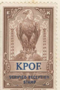
WESTMINSTER (DENVER) 946