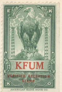
COLORADO SPRINGS 950