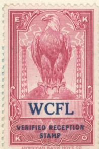
CHICAGO (MUNICIPAL PIER)