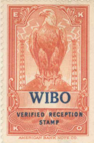
DES PLAINES (CHICAGO)