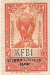
S.F. (PORTABLE AIRPLANE) 10